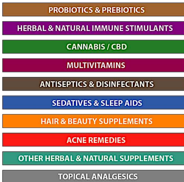
2020: YEAR THE PANDEMIC HIT