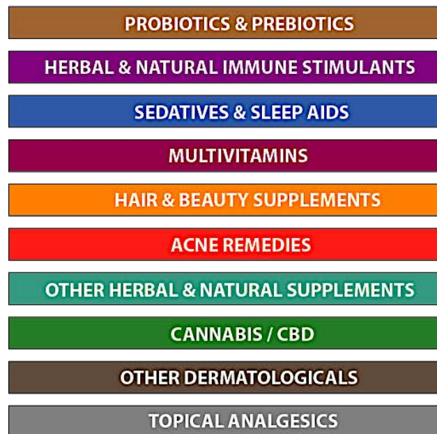
2021: EMERGING OUT OF THE PANDEMIC